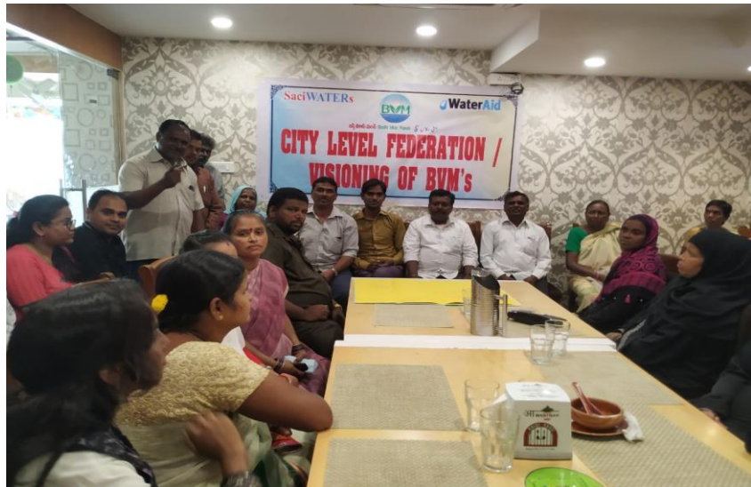
City level BVM committee members