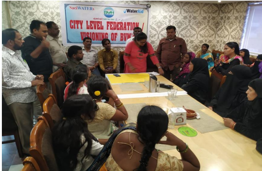
Sharing of progress made by the committee so far and their requirements